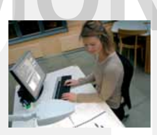
The PlateWriter™2000 features a semi-automatic plate alignment system to ensure accurate registration and transport through the imaging engine.

The finishing unit includes a built-in gumming station to finish the plates for storage or immediate use on press. The daylight operation and chemistry free approach makes iCtP the ideal low maintenance platemaking solution.